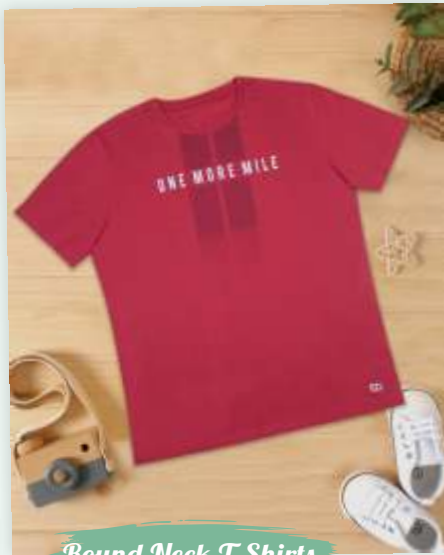
Round Neck T-Shirts