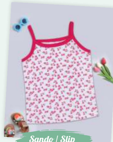
Sando | Slip