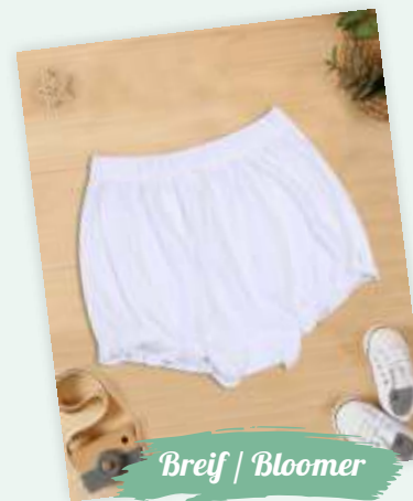
Brief | Bloomer