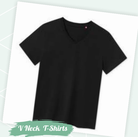
V Neck T-Shirts